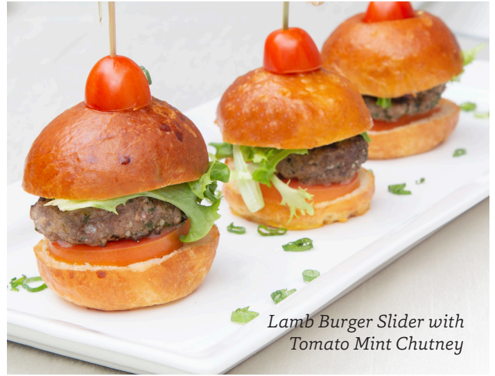
Lamb Burger Slider with Tomato Mint Chutney