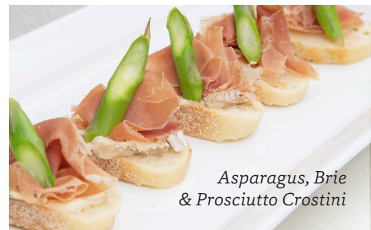
Asparagus, Brie & Prosciutto Crostini