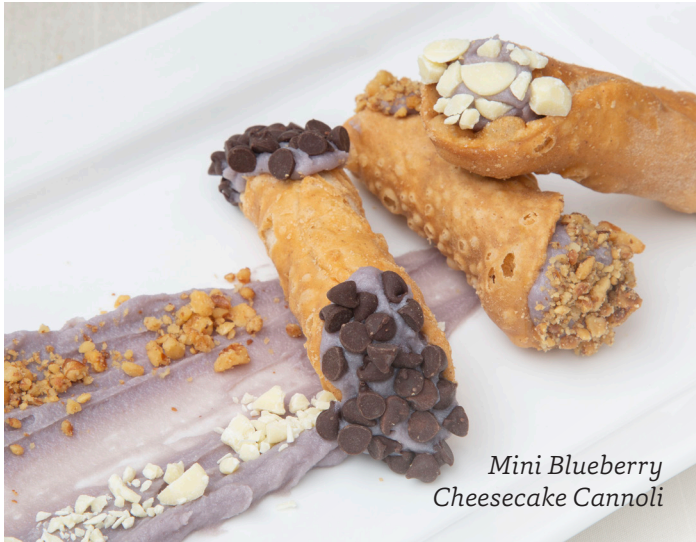
Mini Blueberry Cheesecake Cannoli