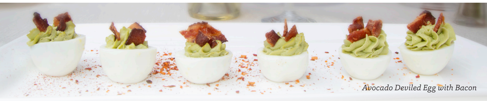
Avocado Deviled Egg with Bacon