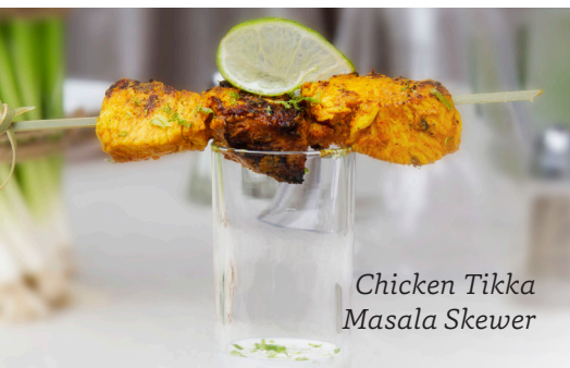
Chicken Tikka Masala Skewer