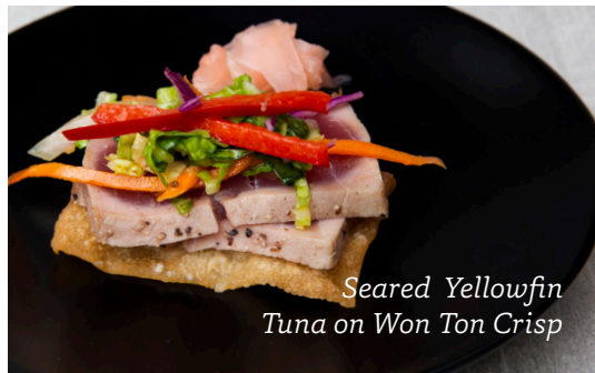
Seared Yellowfin Tuna on Won Ton Crisp