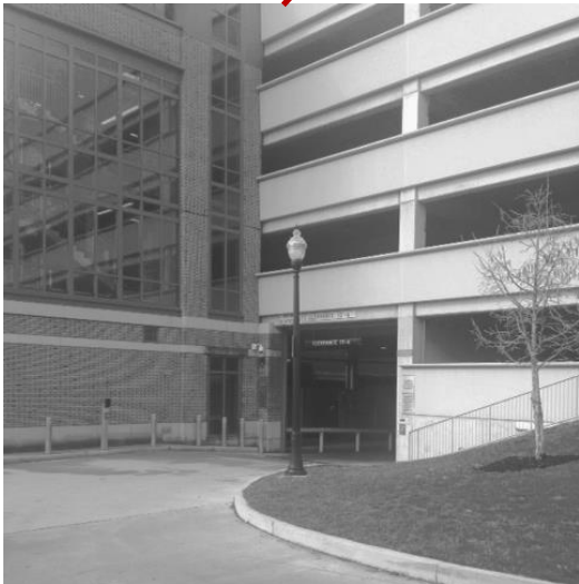
Entrance from High Street